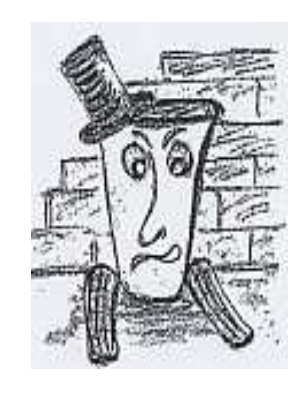
"I will be following the Arts Trail, as usual – although I don't expect to pick anything up!"

The Saltaire Sentinel , written by the people of Saltaire and photocopied by Shipley College in the heart of Saltaire every month, is not affiliated to, nor in any way controlled or influenced by any group, society or organization. sentinel@saltairevillage.info Sadly, sooner or later you will dispose of this copy of the Sentinel . Please do so with care for our World Heritage Site environment.