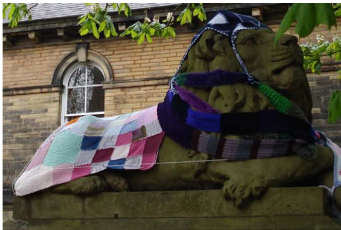
Everyone's favourite lion appropriately festooned for the Arts Trail last month.