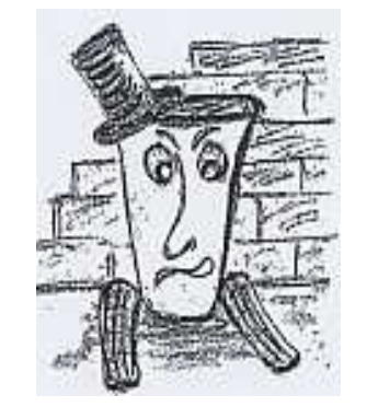
"Thank you to everyone who mentioned my plight in the recent survey."

WORLD HERITAGE <u>WHEELIE</u> Does NOT talk rubbish