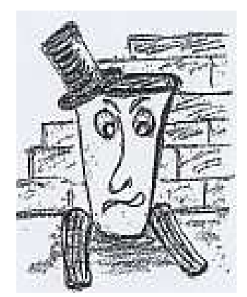
"I wonder if I have a counterpart in Crespi?"

The Saltaire Sentinel is written by the people of Saltaire and photocopied by Shipley College in the heart of Saltaire <u>EVERY</u> <u>MONTH.</u> It is not affiliated to, nor in any way controlled or influenced by any group, society or organisation. Sadly, sooner or later you will dispose of this copy of the Sentinel . Please do so with care for our World Heritage Site environment.